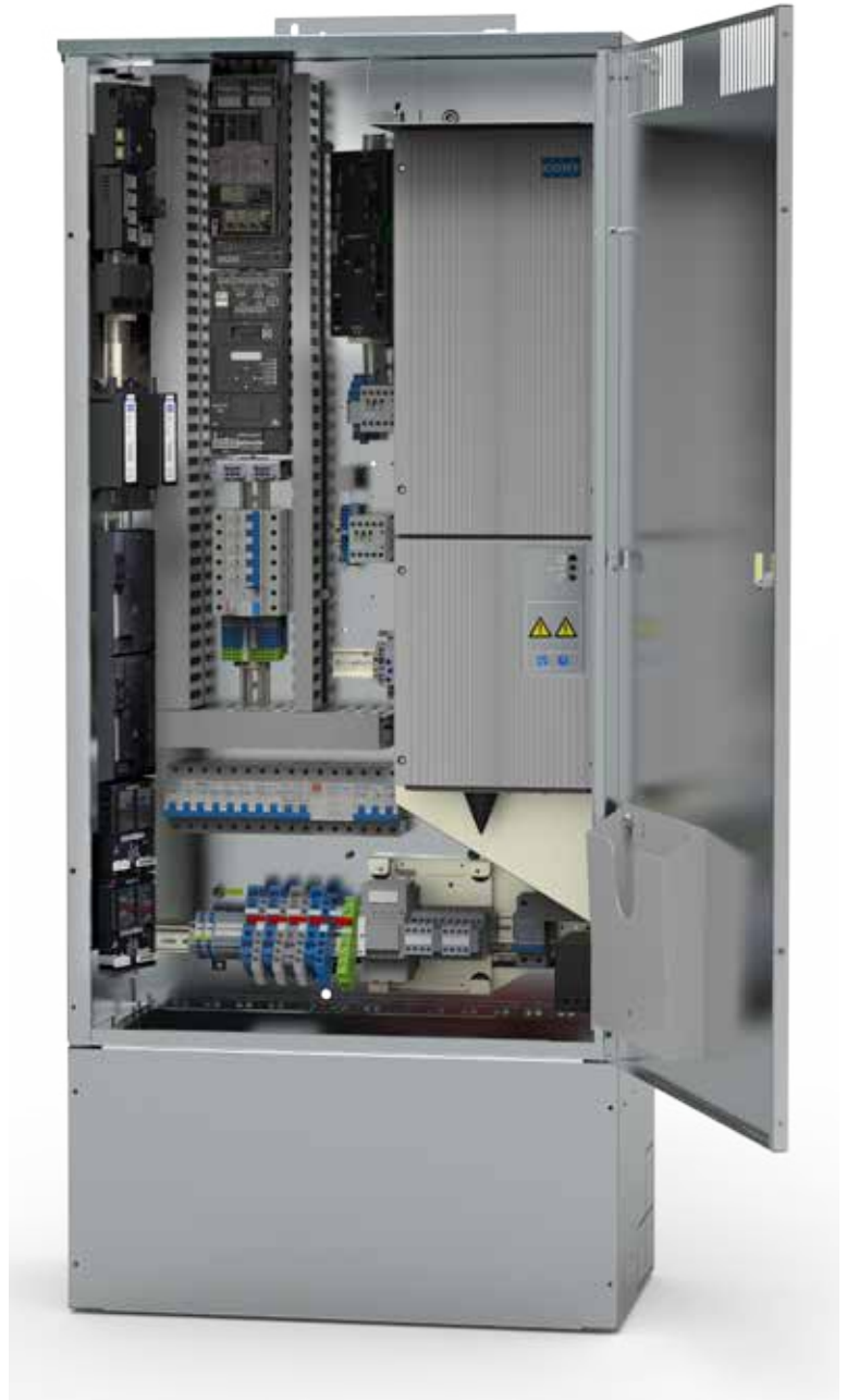
The KONE ReSolve™ 400 controller cabinet

KONE ReSolve is suitable for modernizing the electrification systems of both traction and hydraulic elevators in buildings of up to 32 floors. For traction elevators, the solution provides flexibility in terms of planning and budgeting as the modernization can be carried out in two phases, replacing the electrification first and the hoisting system later.